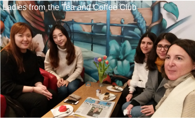
Ladies from the Tea and Coffee Club

"It was my first time joining the women's conversation club and it was a great experience, it was really exciting to meet lots of students and make some new friends. I had a vanilla cake with strawberries and also ordered hot chocolate. It was huge and everyone was looking at it! It had lots of cream on top and it was really delicious!" (Shahad, Saudi)