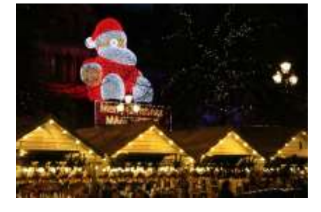
2. Christmas Markets — 10th November.