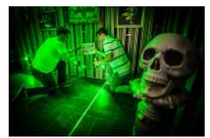
3. Escape Room — 14th November. Pay £4 at the reception by 4th November.