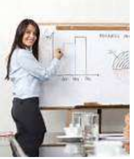
4. New B2 level Business English class on Tuesdays at 3pm.